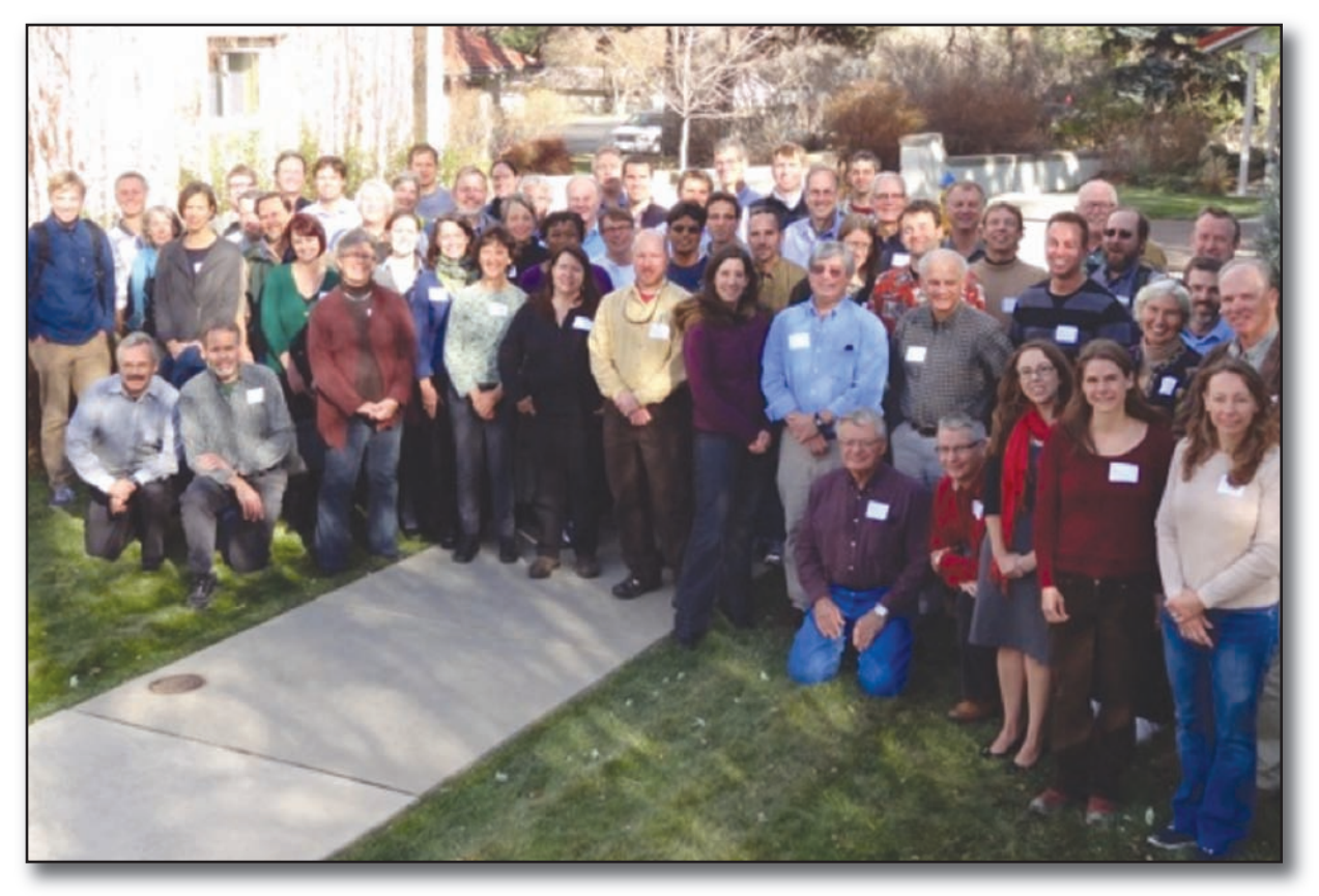
Figure 1. NAML-OBFS workshop attendees

Here we report on the proceedings of the workshop. We organize the major points brought up in each working group and cross-cutting theme discussion into sections on (1) the unique attributes of FSMLs that address each topic, (2) the emerging issues identified by each group, and (3) future directions the group envisioned. Exchanges between the groups during mashup sessions are integrated into the individual working group reports. While the workshop encouraged wide-ranging conversation, we have structured the report to focus on the role FSMLs will play in addressing emerging issues. This report is meant to capture those discussions, but not to analyze them or offer recommendations. The steering committee will deliver a separate final report containing a series of recommendations generated using input from the workshop, survey data from FSMLs, and broad input from the larger stakeholder community of FSMLs (Billick et al. 2013). What follows is an account of the dialogues at the OBFS and NAML workshop on Building the Field Stations and Marine Laboratories of the Future.