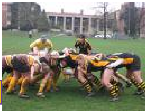
Women Rugby players in a scrum

Props Hooker Second row forward Loose forward