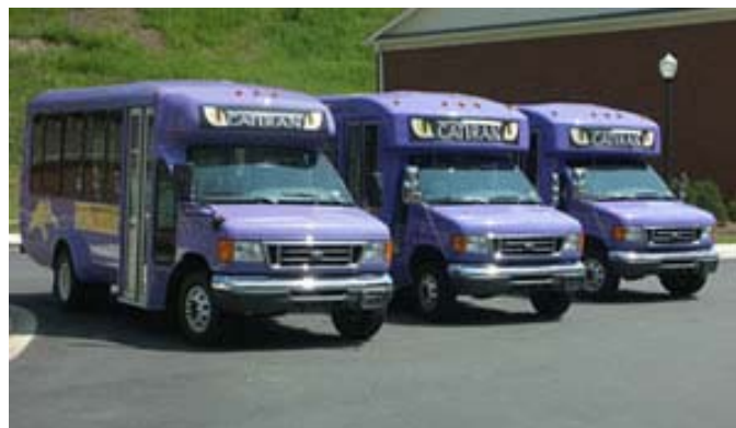
Image of University Cat Trans.