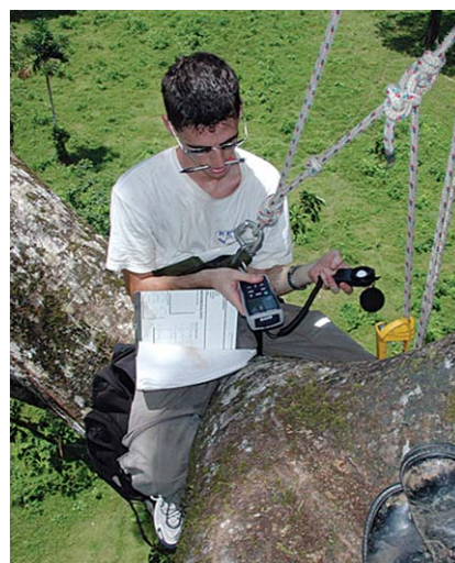
Student takes light-intensity readings from the crown of a ceiba tree, 150 feet above the ground. This exercise was part of his independent research project, which examined the correlation between light intensity and the presence and diversity of epiphytes.

Despite the broad range of courses, there is some commonality in the nature of the course structure and in the types of pedagogy FSML professors use. The size of the class is small, often under 15; this class size allows considerable interaction among students and professors, which can result in greater student achievement (Follman 1994). Course participants often meet for full days, several days a week, and spend a lot of time in the field. In most instances, faculty are responsible for teaching all components of the course—whether at the lectern or in the laboratory or field—unlike the case at many larger campuses, where teaching assistants carry out laboratory instruction. Hands-on and experiential active learning are common pedagogies, and students are often involved in individual or group work. For many students, this will be their first experience with either guided or open-ended inquiry. Undergraduate students who do not have the